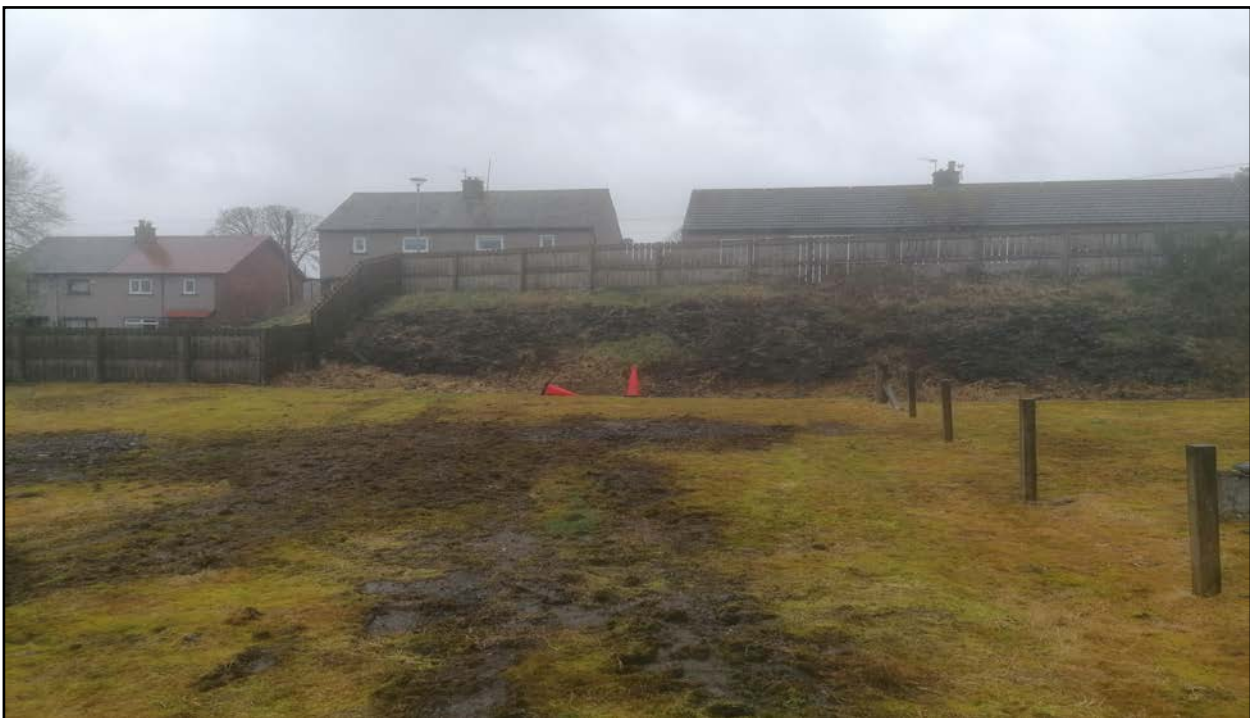
View facing north across the application site taken from the south-east boundary at the access point.

In considering the increase in building height proposed, Condition 1 of planning permission 14/0409/IC sets out that development is to accord in general terms with the requirements of the approved design brief. The design brief identifies that in terms of massing, houses shall be a maximum of 2 storeys in height, that attic trusses may be permitted for loft use or conversion and dormer windows are permitted subject to full planning approval. Roof pitches should be between 20 and 40 degrees which the proposed roof meets. The proposed design includes a second-floor level which would be contained within the attic trusses. The design brief permits the provision of a space within the attic trusses for loft use or conversion and as such, the proposal is not considered to conflict with this element of the design brief.