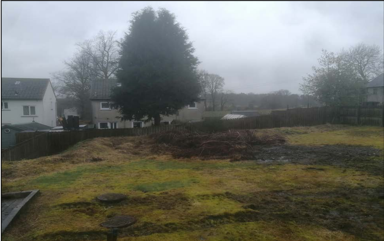
View facing west across the application site taken from near the south-east boundary.

building. If the VSC, with the new development in place is both less than 27% and less than 0.8 times its former value, occupants of the existing building will notice a reduction in the amount of daylight. With the site currently being cleared, the window at 110 Finlaystone Road has an existing VSC of 40% (no impediment to daylight) and the windows at 100 Finlaystone Road, have an existing VSC of 37.5% VSC for the northern window and 38% VSC for the southern window. With the proposal in place, the VSC for the window at 110 Finlaystone Road will be 39% VSC and for the ground floor windows at 100 Finlaystone Road will be 34.5% VSC for the northern window and 35.5% VSC for the southern window. All of these are above the 27% VSC recommended. It stands that the proposal will not result in an unacceptable loss of light to any rooms in neighbouring houses.